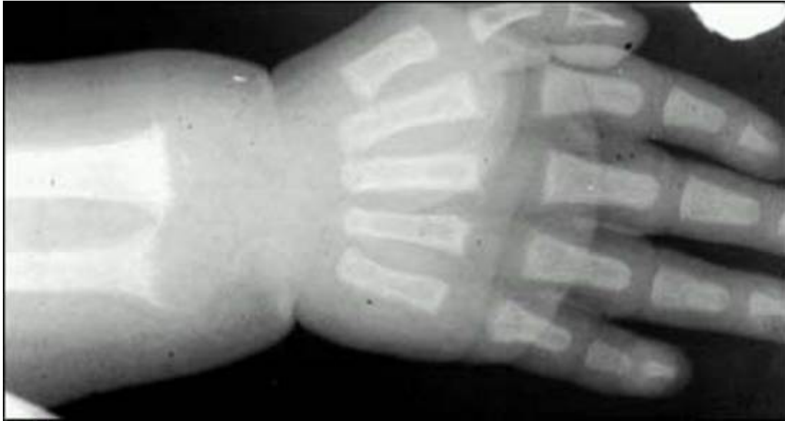
Figure 3. Radiograph of the wrist and hand of a patient with rickets. Note scalloping, widening and irregularity of metaphyseal end of the ulna; apparent widening of the joint space as a result of absence of epiphyseal provisional calcification.

The clinical features of osteomalacia in adults are subtle and could be manifested as bone pain or low back pain of varying severity in some cases. Severe muscle weakness and hypotonia may be a prominent feature in adults with vitamin D deficiency. Improvement of myopathy occurs after low doses of vitamin D.