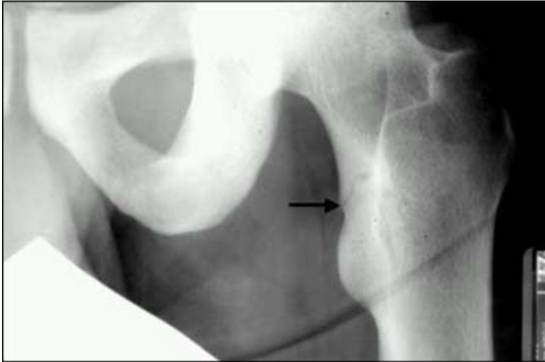
Figure 4. Young male with osteomalacia. Note a pseudofracture in the medial edge of the upper femoral shaft (arrow).

In hypocalcemic rickets and/or osteomalacia, as is the case in disorders in vitamin D action, there may exist radiographic features of secondary hyperparathyroidism such as subperiosteal resorption and cysts of the long bones.