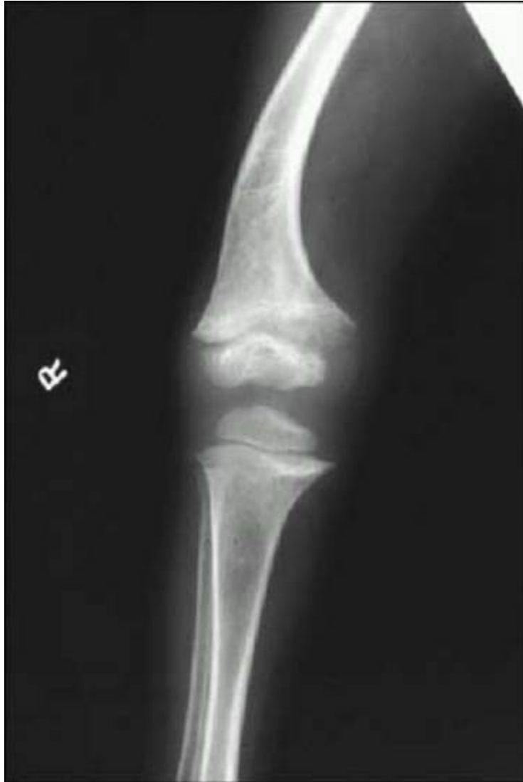
Figure 2. Radiograph of distal femur and proximal tibia and fibula of a patient with rickets. Note widening of epiphysis, resorption of provisional zone of calcification, flaring of metaphysis and bone deformity.