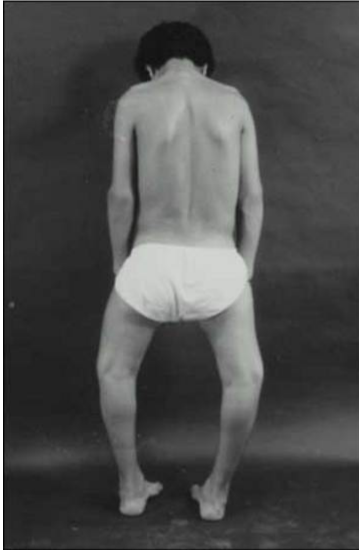
Figure 1. Teenage male with rickets. Note deformities of legs (bow legs) and compromised height.

The specific radiographic features of rickets reflect the failure of cartilage calcification and endochondral ossification and therefore are best seen in the metaphysis of rapidly growing bones (Figures 2 and 3). The metaphyses are widened, uneven, concave, or cupped and because of the delay in or absence of calcification, the metaphyses could become partially