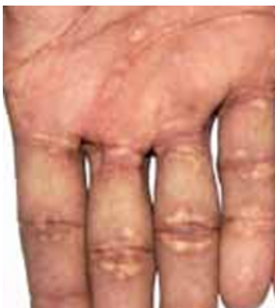
Figure 2. Palmer xanthoma

In a large cohort collected over a 35-year period in Canada, 524 patients met the gold standard Fredrickson criteria for dysbetalipoproteinemia (plasma triglyceride between 150-1,000 mg/dL and VLDL-cholesterol/triglyceride mass ratio >0.30 ) (58). However, only 197 subjects (38%) had the apo \epsilon 2/\epsilon 2 genotype. This finding contrasts with earlier reports based on a smaller number of subjects, which indicated that 90% of patients with dysbetalipoproteinemia carried the apo \epsilon 2/\epsilon 2 genotype. Clinically, patients who met the Fredrickson criteria and had the apo \epsilon 2/\epsilon 2 genotype exhibited more severe phenotypes than those without it. These individuals had significantly higher levels of remnant cholesterol, a greater frequency of xanthomas, and a higher prevalence of atherosclerotic cardiovascular disease (ASCVD) (58). Additionally, those with the apo \epsilon 2/\epsilon 2 genotype demonstrated an 11-fold increased risk of peripheral artery disease (PAD) compared to those without it. This study suggests that dysbetalipoproteinemia may manifest as a less severe multifactorial remnant cholesterol disease in individuals without the apo \epsilon 2/\epsilon 2 genotype and as a more severe form associated with the apo \epsilon 2/\epsilon 2 genotype (58).