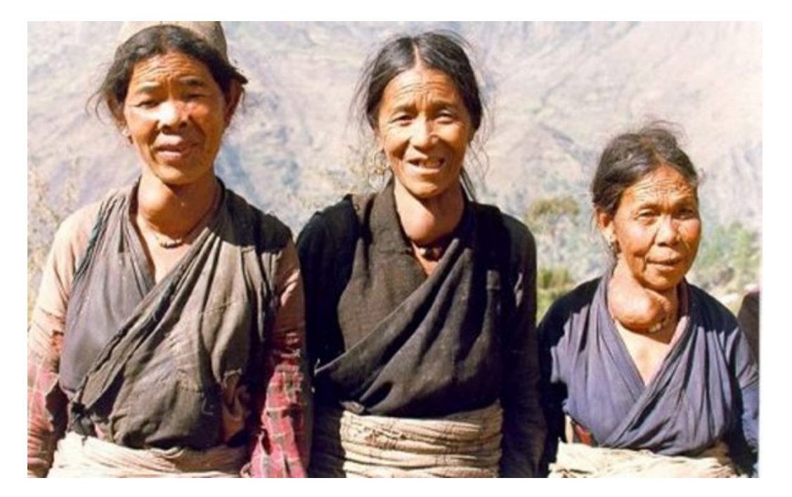
Figure 6. Three women of the Himalayas with stage II goiters.

<sup>b</sup> In lactating women, the figures for median urinary iodine are lower than the iodine requirements because of the iodine excreted in breast milk.