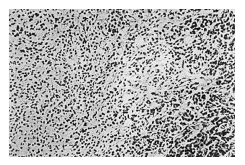
Figure 3. Histological section of large goiter removed because of pressure symptoms in Papua New Guinea, showing intense hyperplasia with no colloid. From Buttfield and Hetzel (140).

Marine cycle. In this formulation, repeated episodes of hyperplasia induced by iodine deficiency are followed by involution and atrophy, the result being a gland containing a mixed bag of nodules, zones of hyperplasia, and involuting, degenerative, and repair elements.