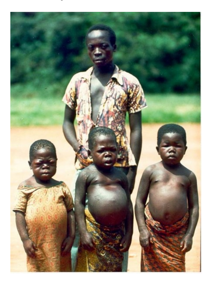
Figure 5. Myxedematous endemic cretinism in the Democratic Republic of Congo. Four inhabitants aged 15-20 years : a normal male and three females with severe longstanding hypothyroidism with dwarfism, retarded sexual development, puffy features, dry skin and hair and severe mental retardation.

The typical myxedematous cretin (Fig 5) has a less severe degree of mental retardation than the neurological cretin, but has all the features of extremely severe hypothyroidism present since early life, as in untreated sporadic congenital hypothyroidism (127-129): severe growth retardation, incomplete maturation of the facial features including the naso-orbital configuration, atrophy of the mandibles, puffy features, myxedematous, thickened and dry skin, dry and decreased hair, eyelashes and eyebrows and much delayed sexual maturation.