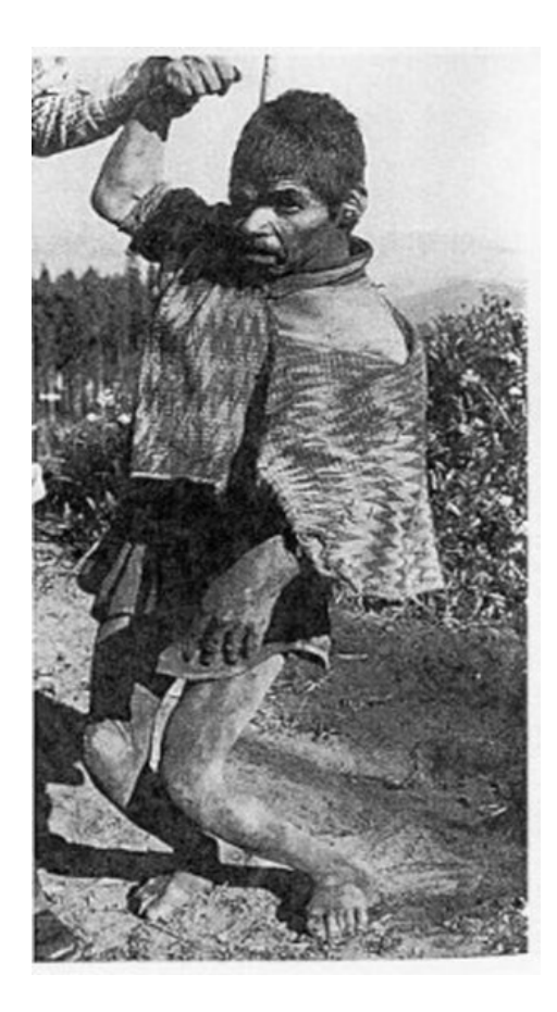
Figure 4 (b). Male from South western China with the typical facies of neurological cretinism, who is also deaf-mute and suffering from less severe proximal muscle weakness in lower limbs.